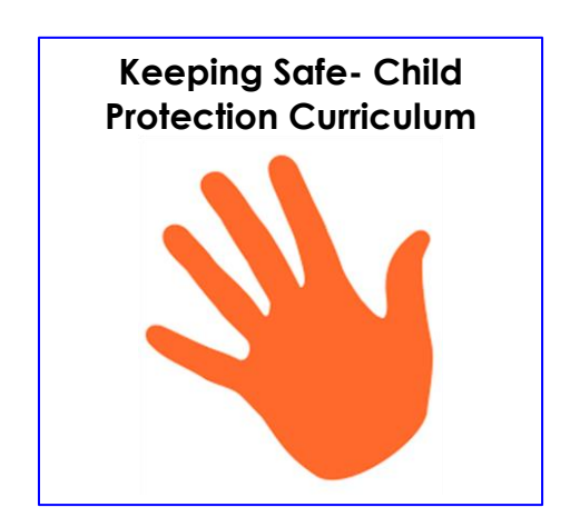
Term 1 Overview 2020